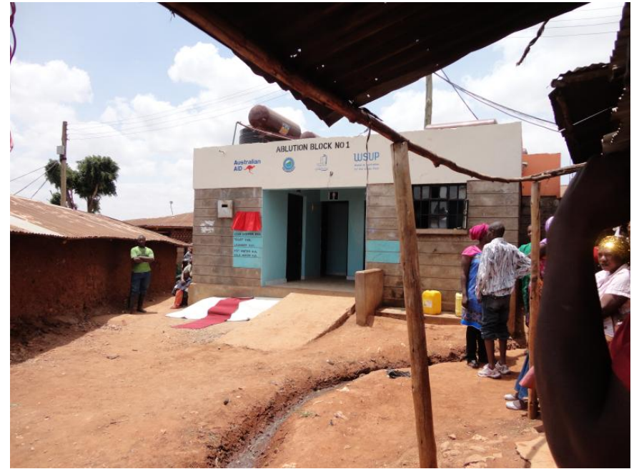
Kibera, Nairobi – 2012