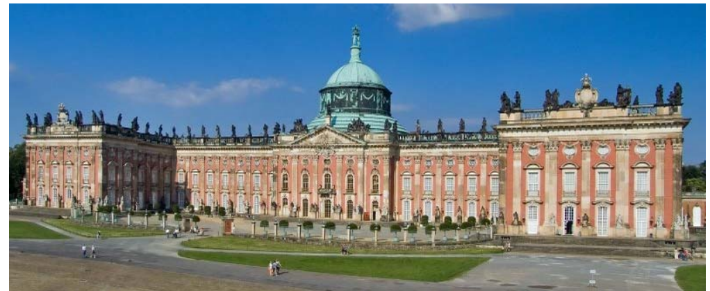
Potsdam University (Palais Sanssouci)

Federal Ministry for the Environment, Nature Conservation and Nuclear Safety