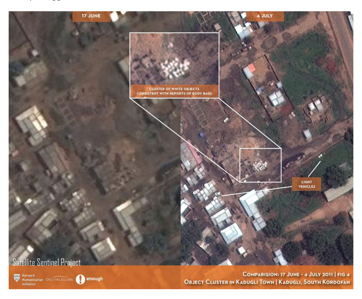
Figure Four: Comparison Images of White Object Cluster in Kadugli (Satellite Sentinel Project 2011)

SSP responded to Ambassador Lyman's statement by saying that the American intelligence sources he cites were wrong and that the white objects were not visible in satellite images taken just before the fighting on June 7 or 17, 2011. SSP presented DigitalGlobe images (figure four below) in support of their assessment.