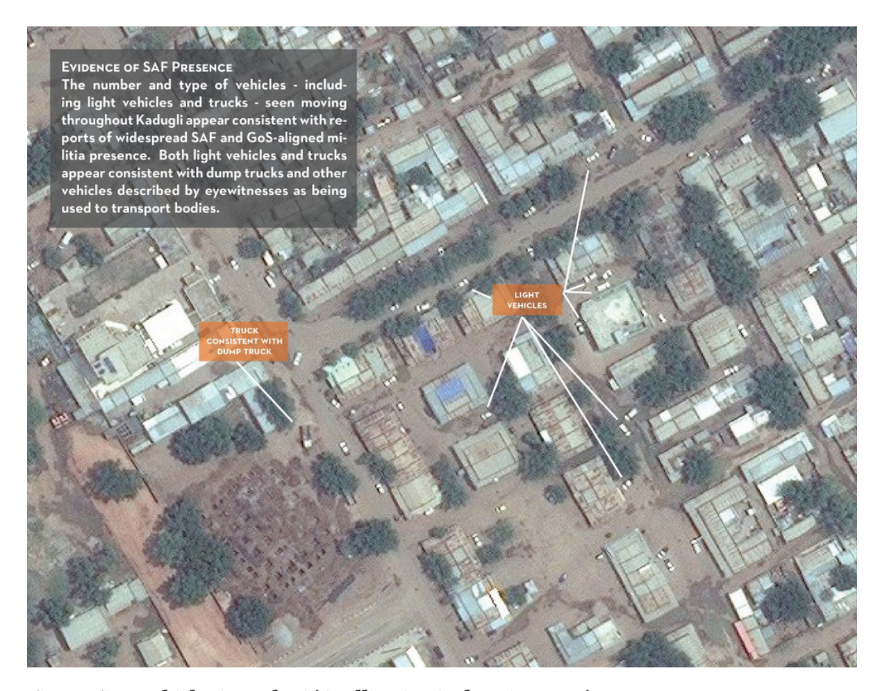
Figure Five: Vehicles in Kadugi (Satellite Sentinel Project 2011)

SSP also identified what it described as vehicles used by SAF and GoS-aligned forces, plus vehicles used to transport bodies to the mass gravesite. Figure five offers a satellite image released by SSP in support of this contention. In the annotation, SSP identifies what it says are vehicles "consistent with those used" by SAF and GoS-aligned forces and dump trucks used to haul bodies to the mass gravesites.