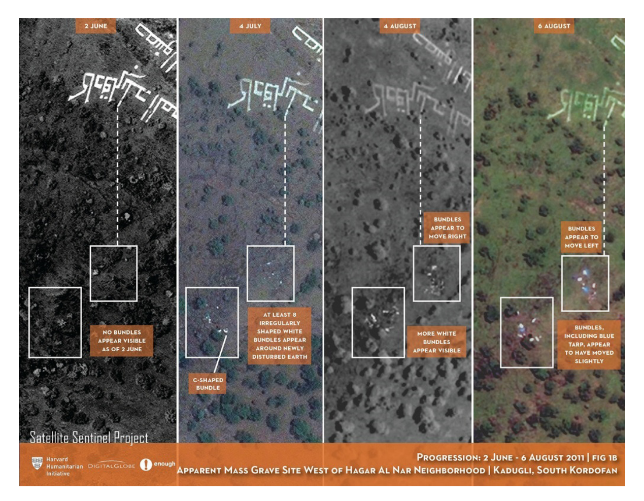
Figure Six: Revisits to Site of Suspected Mass Graves (Satellite Sentinel Project 2011)

Figure six presents a series of georectified DigitalGlobe images of the suspected mass gravesites on June 2, July 4, August 4, and August 6. White bundles "consistent to those seen in Kadugli" earlier, are visible in the last three frames. The June 2nd image, taken before the alleged massacre took place, shows no sign of the white objects.